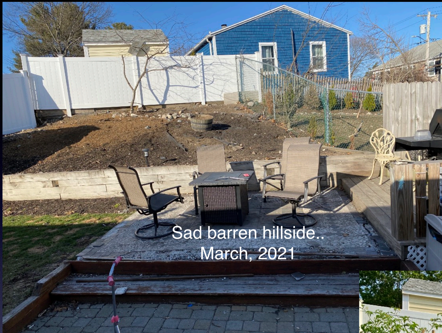
Sad barren hillside.. March, 2021