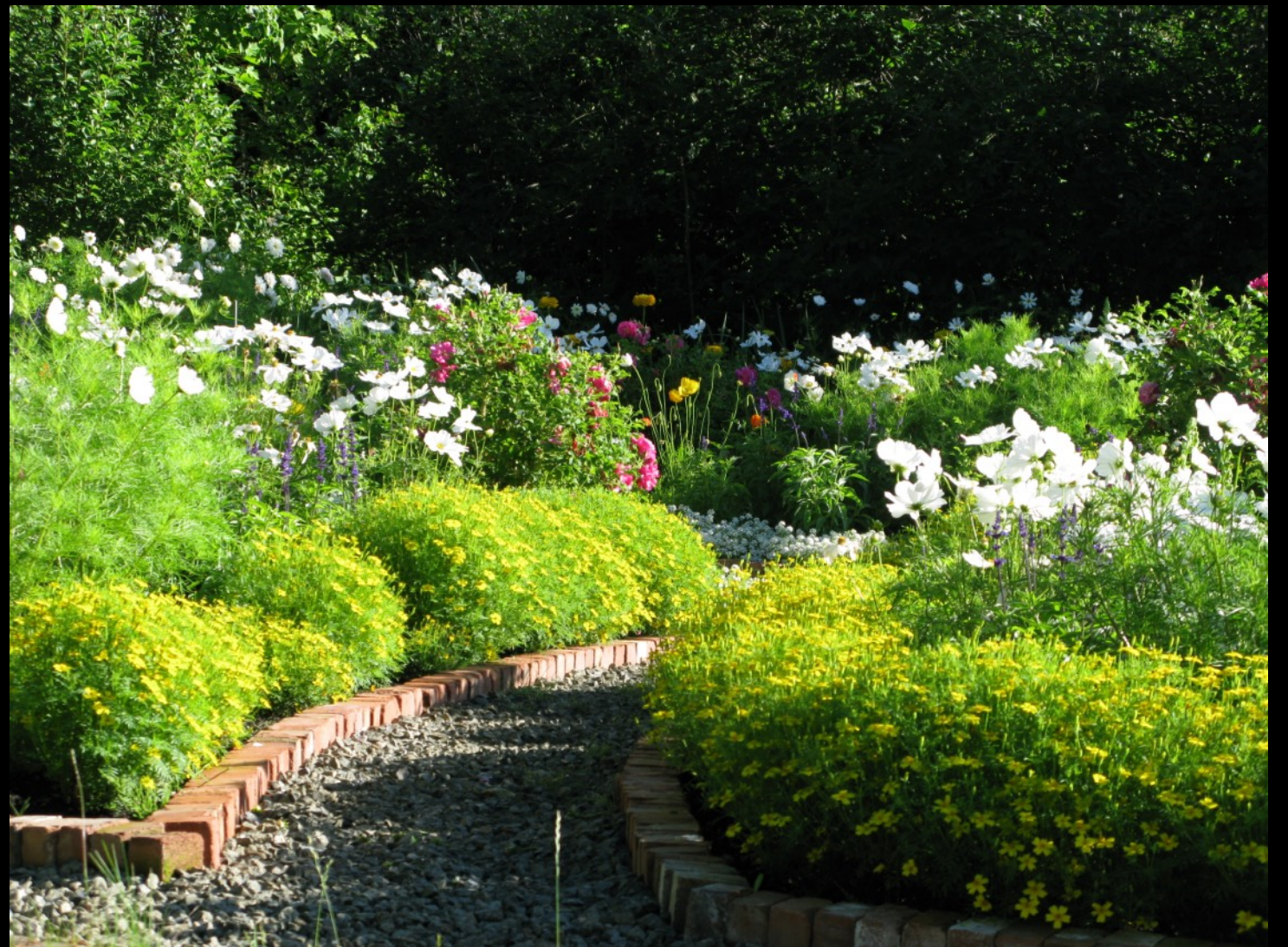
Revision with annuals