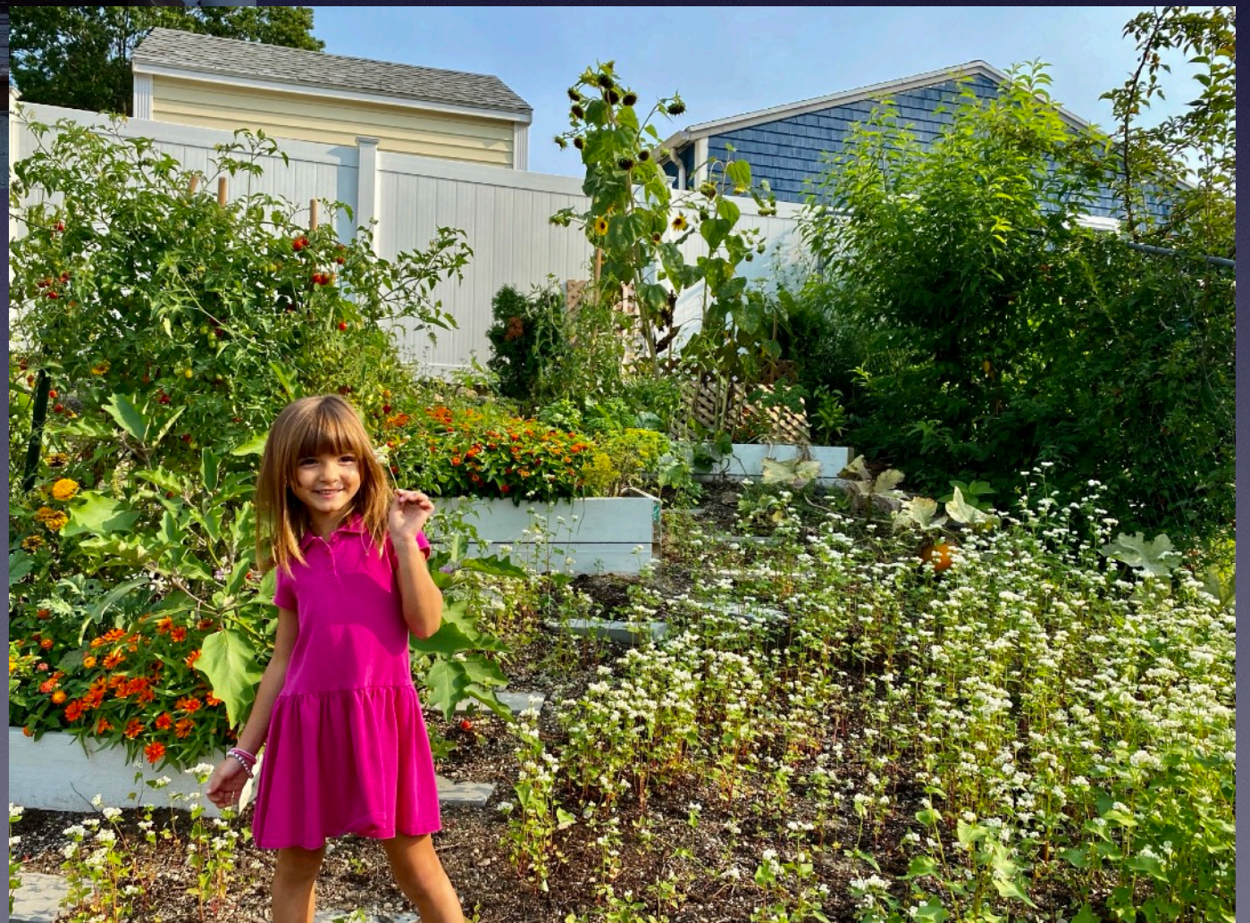
Raised beds and ground cover September 2021