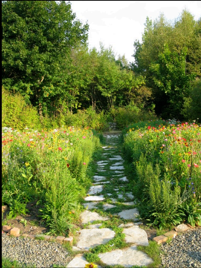
Chaotic first planting