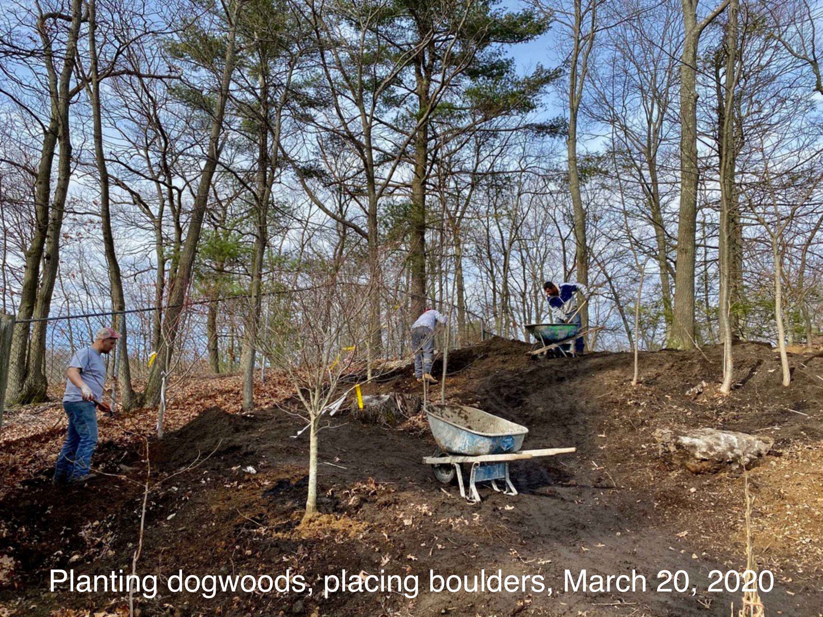
Planting dogwoods, placing boulders, March 20, 2020